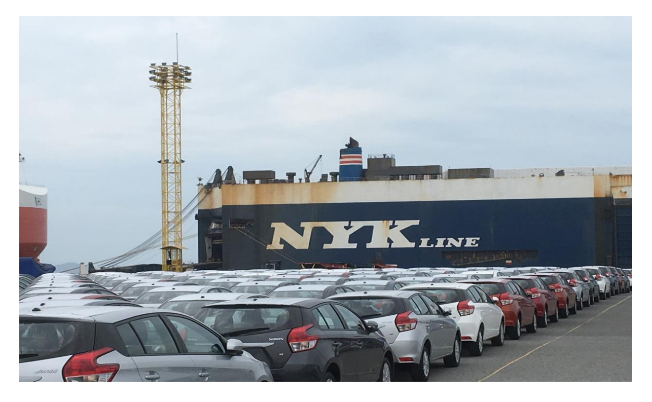
Cars in the pre-loading yard