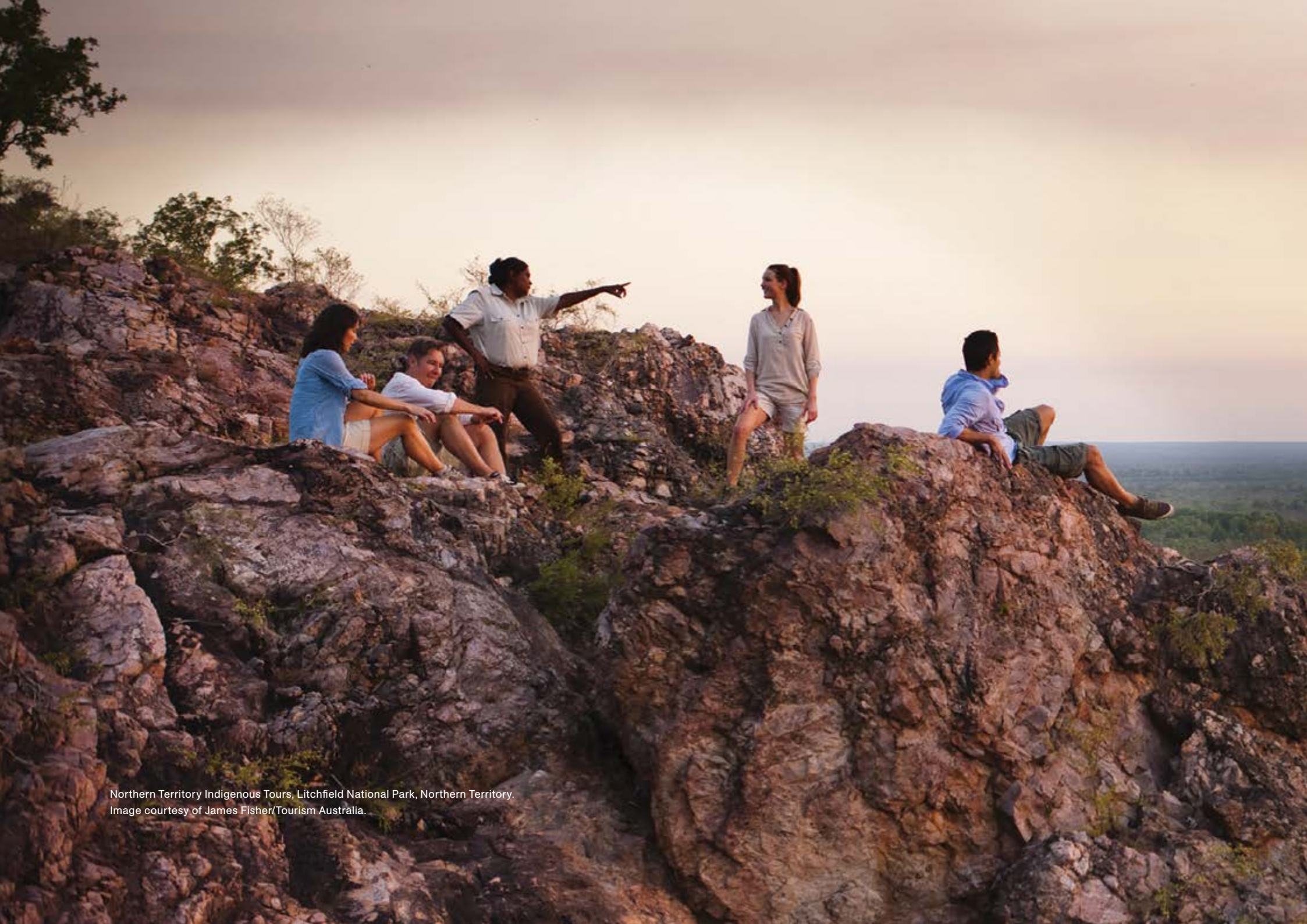
Northern Territory Indigenous Tours, Litchfield National Park, Northern Territory.