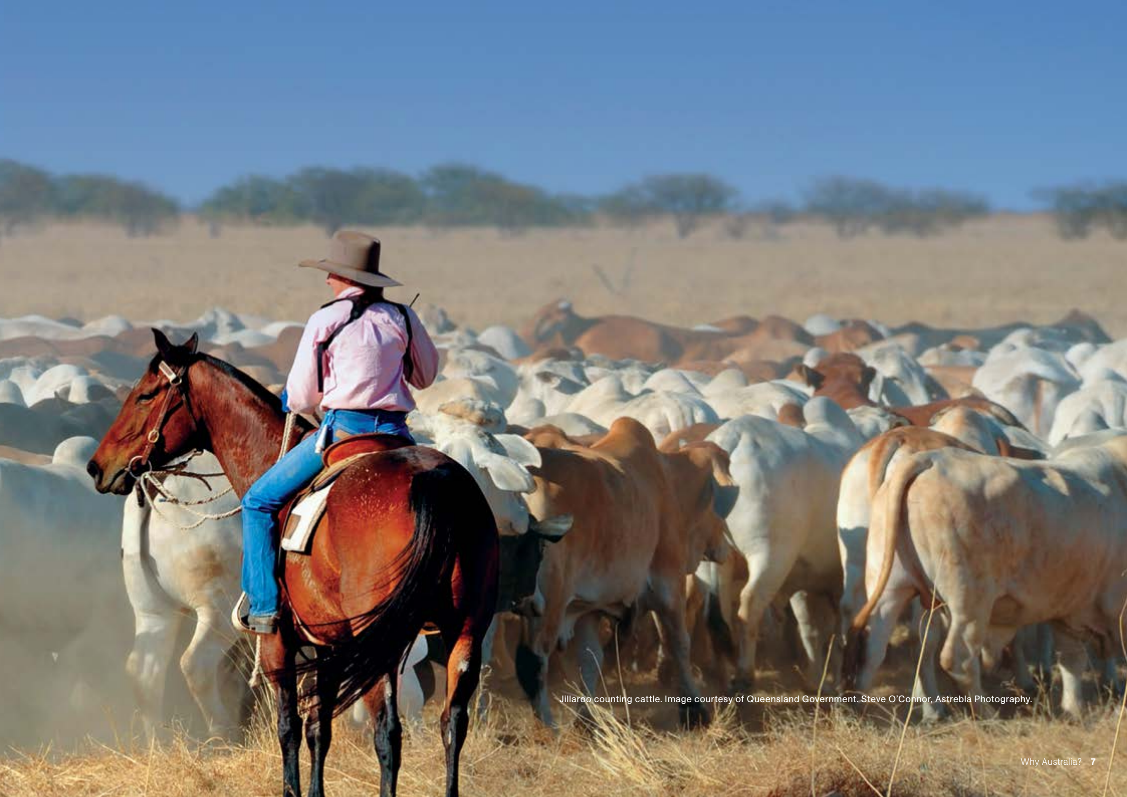
Jillaroo counting cattle.