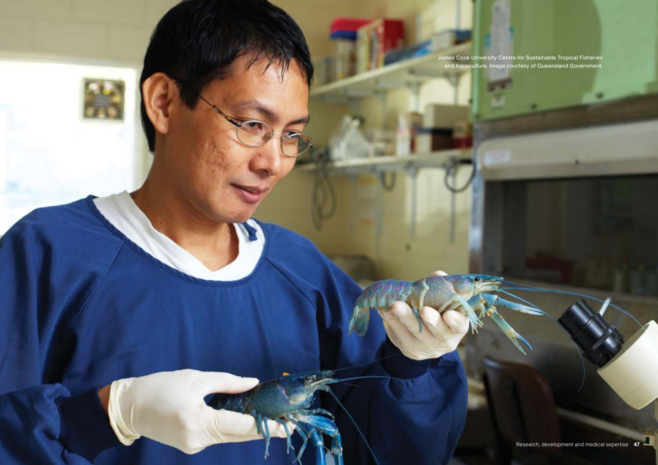
James Cook University Centre for Sustainable Tropical Fisheries and Aquaculture.