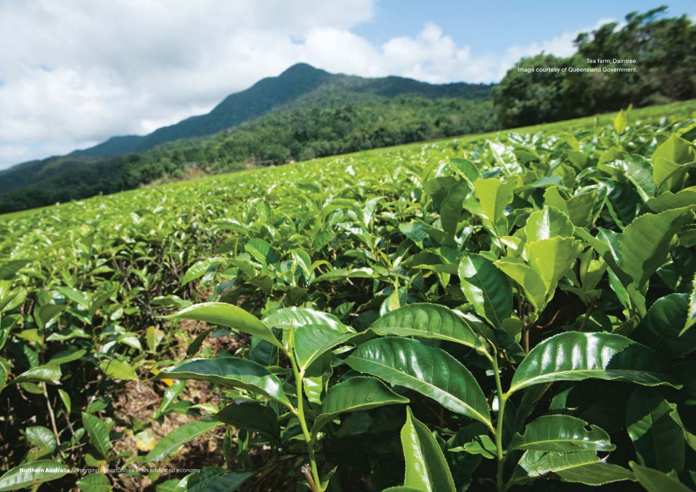
Tea farm, Daintree.