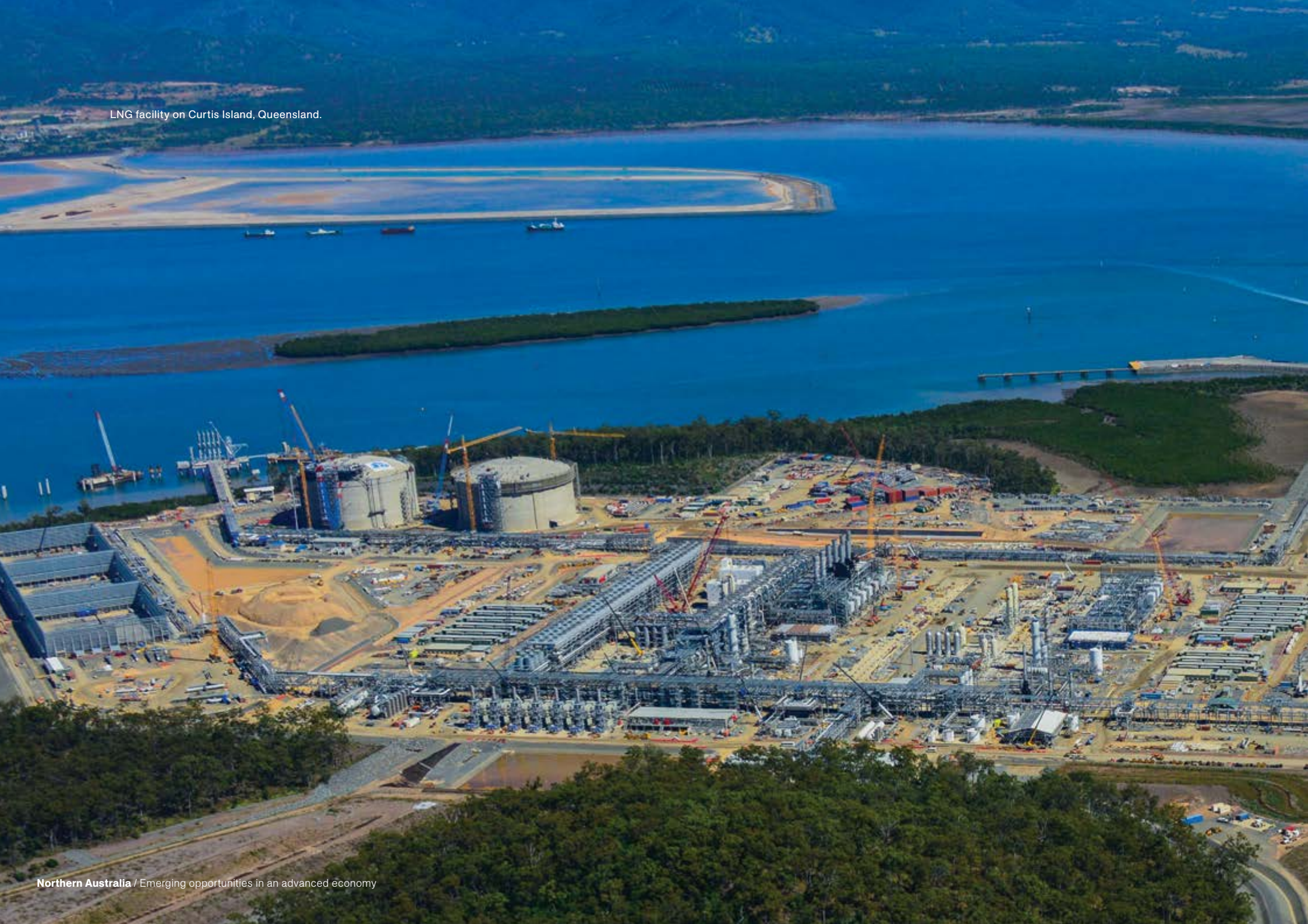
LNG facility on Curtis Island, Queensland.