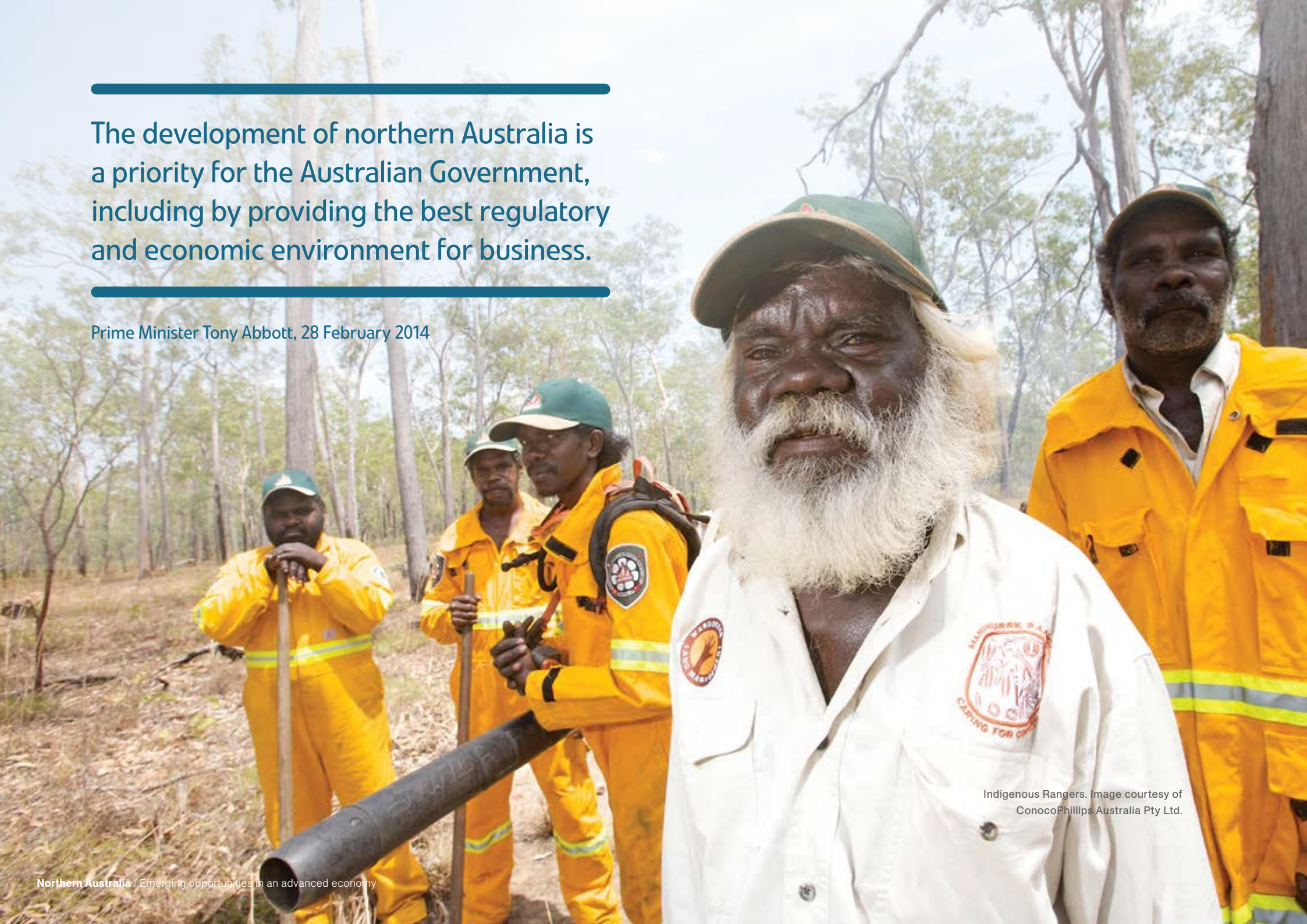
Indigenous Rangers.

Prime Minister Tony Abbott, 28 February 2014