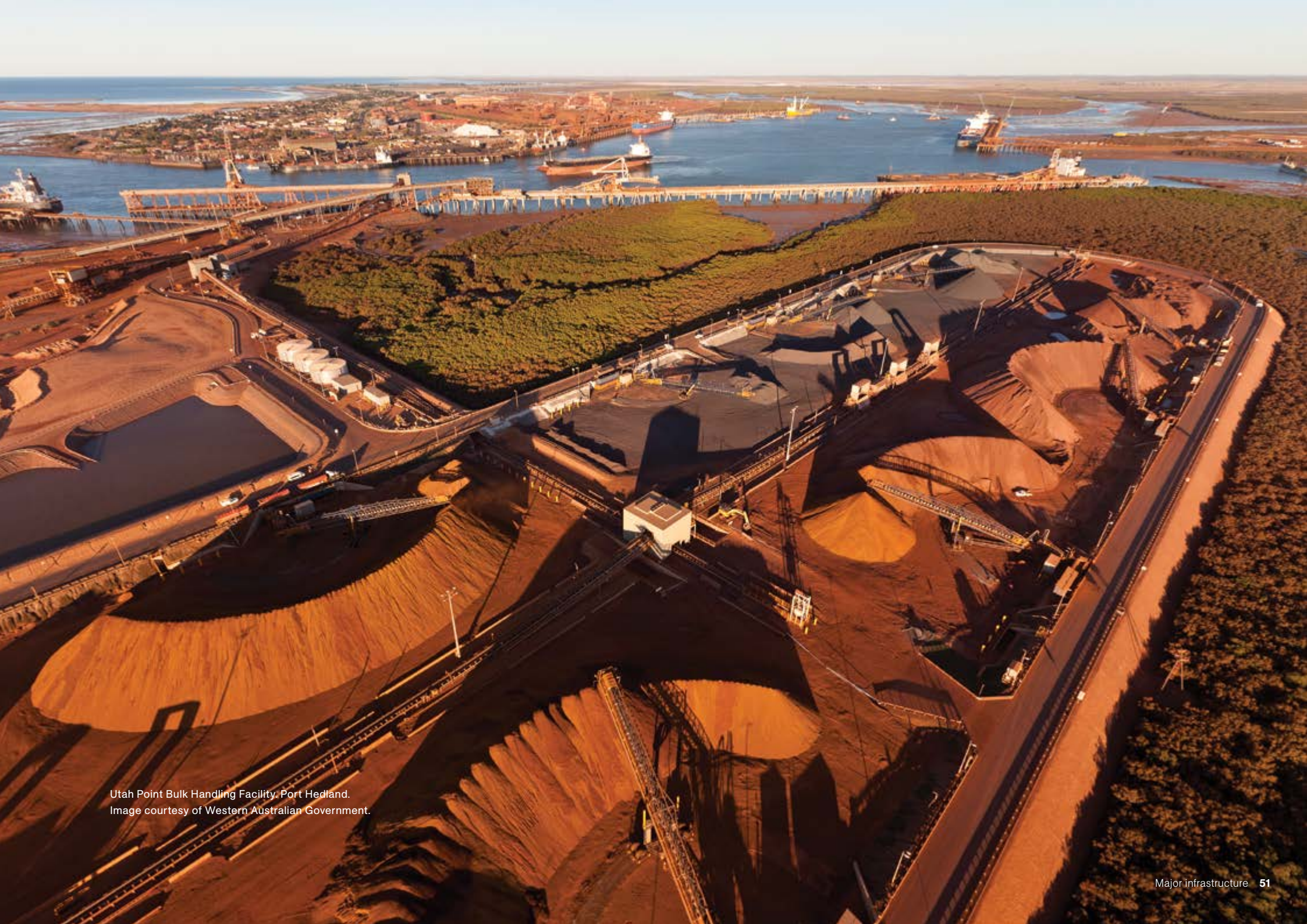
Utah Point Bulk Handling Facility. Port Hedland.